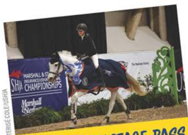
GOLDEN BACKSTAGE PASS