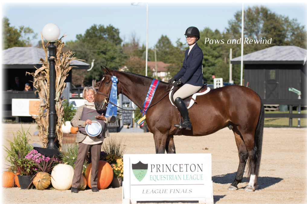
Paws and Rewind

The Princeton Equestrian League is dedicated to providing high quality competitions for Hunter, Jumper and Equitation riders. The league provides an opportunity for riders to compete throughout the year and qualify for the prestigious Princeton Equestrian League National Finals at Princeton Show Jumping in Skillman, NJ.